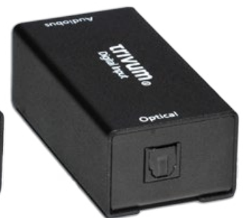
optical TOSLINK jack