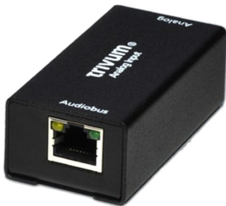
trivum AudioBus connection

The trivum AudioBus is our special bus for audio sources. It's designed for high quality audio connections and to avoid interference.