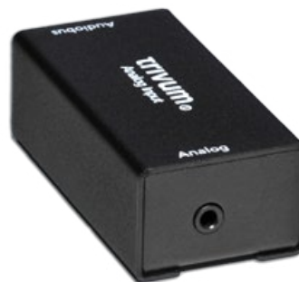
3.5 mm jack socket